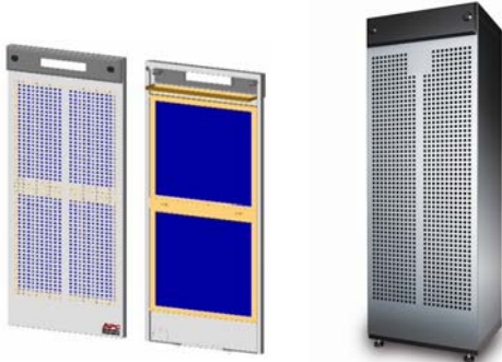
User-replaceable air filters

Allow the UPS easily to be rolled into place